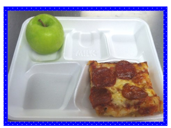
Meat/Meat Alternate 2. Grain Fruit

I. Meat/Meat Alternate Grain Vegetable Milk